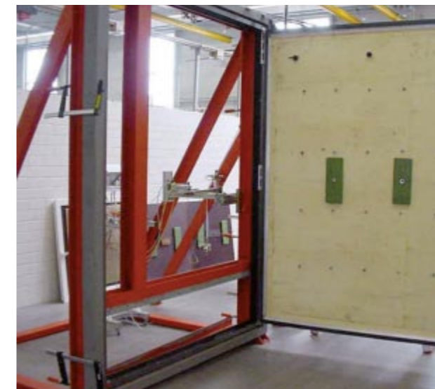
Tension/compression testing machine

Dynamic tests on fittings and elements are carried out on doors and windows up to a height of 4 m. For example, continuous operational testing in accordance with EN 1191 and testing of fittings for windows and French doors, requirements and test procedures for turn/tilt and turn and tilt fittings in accordance with EN 13126-8 can be carried out. Sash widths of up to 1550 mm can be tested.