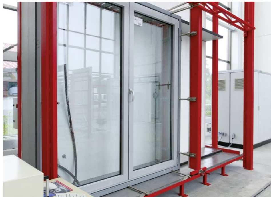
Window test rig

The rig is designed for windows, doors, fixed panels and combinations.