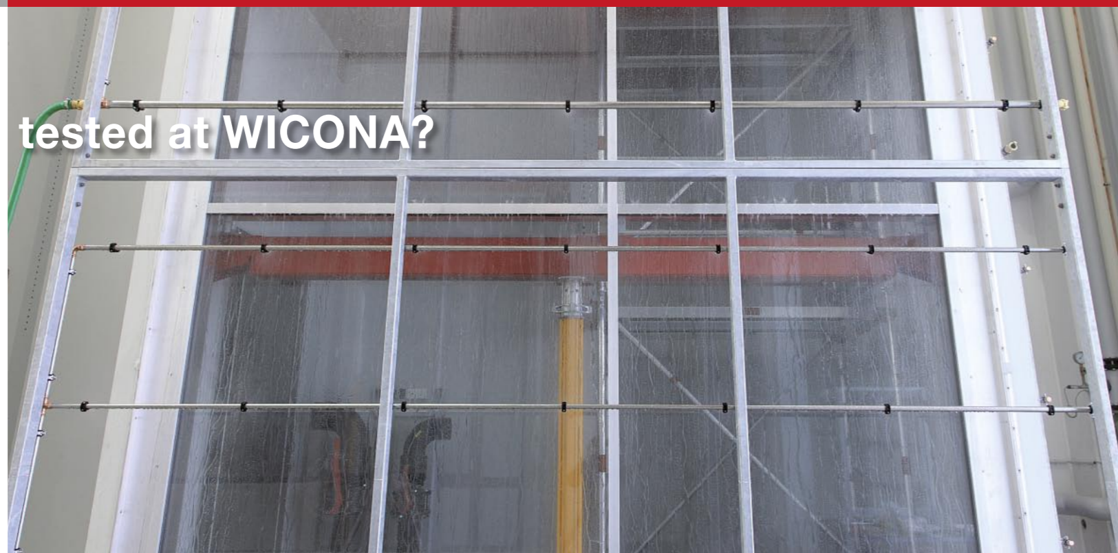
Façade test rigs

Close cooperation with the Institute for Window Technology, ift Rosenheim, forms the backing of the WICONA Test Centre.